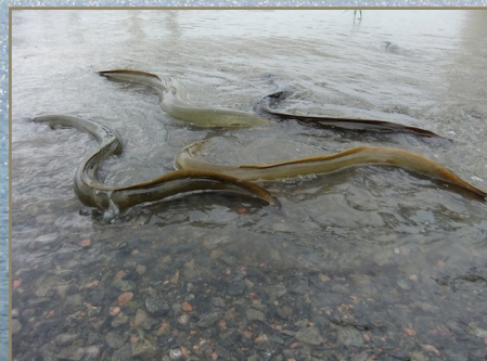
AMERICAN EELS IN THE ST LAWRENCE RIVER SYSTEM IN NORTH AMERICA.

received her PhD in ecotoxicology at the University of Bordeaux in 1997. She is currently Professor of Ecotoxicology at the University of Bordeaux/CNRS. Her research concerns the cellular mechanisms of metals detoxification and the adaptive response of aquatic organisms at the physiological, biochemical and genetic levels.